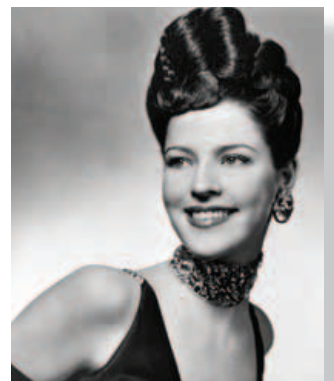
Before volunteering with HPCCR, Dot was a professional dancer.

Interested in becoming a volunteer? See the next training dates in the "Mark Your Calendar" section on page 8, or contact Crystal England at 704.335.3578 or englandc@hpccr.org .