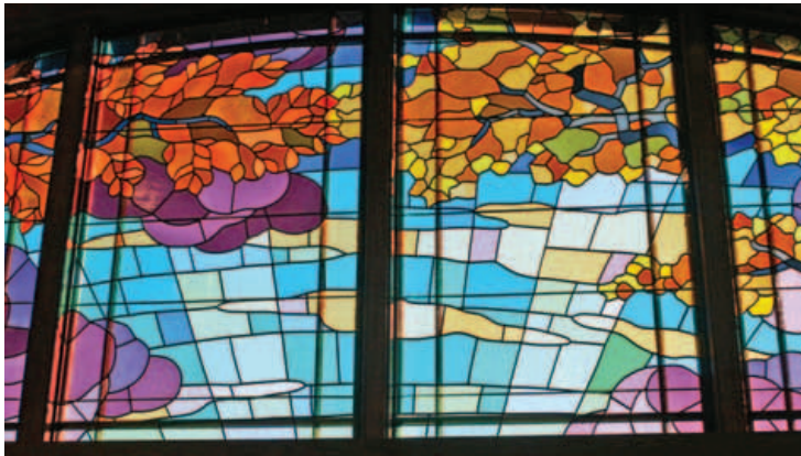
Panels from the stained glass window at LDHH

Over the years, studies have been conducted and articles have been written about the preference that most of us have at the end of life — we want to die at home. Fortunately, a majority of our patients are afforded that opportunity since compassionate home care is one of the foundations of the hospice philosophy. But for patients who have acute pain and other symptoms that are difficult to control at home, we can offer the next best thing — Levine & Dickson Hospice House (LDHH).